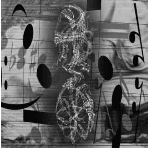
Birth of the Blues , 2006 Front-lit digital print on Kodak Endura 60 x 60 inches, Boston University, Main Lobby Life Science and Engineering building

Untitled , three front-lit, mural digital artworks. Commissioned by Boston University for the main entrance lobby of the Life Science and Engineering building, Massachusetts (see below)