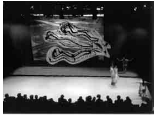
Drawn Breath , 1989

Set and costume designs for the Siobhan Davies Dance Company. Choreography by Siobhan Davies. London Premiere at Riverside Studio's, England