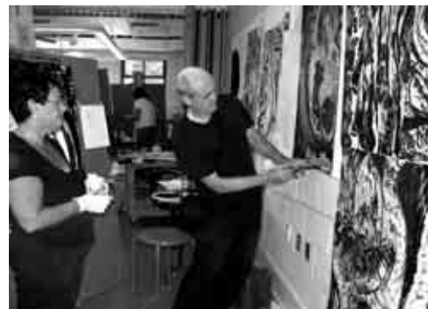
Growing Things™ Workshop , 2005 The von Liebig Arts Center, Naples, Florida, (Photo: Tina Eden)