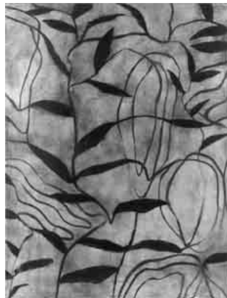
To Tell The Crooked Rose , 1995 Oil on canvas, 96 x 78 inches Times Warner Collection

1979 Ikon Gallery , Birmingham, England. Paintings and Drawings 1982 Marlborough Gallery , New York. Paintings and Drawings 1983 Rahr-West Museum , Manitowoc, Wisconsin. Paintings and Drawings 1984 Marlborough Gallery , New York. Works on paper and Monoprints 1985 Marlborough Graphics , London. Works on paper Marlborough Fine Art , London. Paintings and Drawings 1987 Marlborough Gallery , New York. Paintings and Drawings 1988 Eva Cohon Gallery , Chicago. Paintings 1989 Hokin Gallery , Palm Beach, Florida. Paintings 1990 Eva Cohon Gallery , Chicago. Paintings and Works on paper 1991 Marlborough Gallery , New York. Paintings and Drawings 1992 Denise Cadé Gallery , New York. Drawings and Pastels: The Lake Series 1994 Jan Abrams Gallery , Los Angeles. Paintings and Drawings: The Lake Series 1995 Freedman Gallery , Albright College, Pennsylvania. Drawings: The Lake Series and The Body Echo™ Project Art Museum at The University of Memphis . Drawings: The Lake Series and The Body Echo™ Project 1997 Humanities Gallery , The Cooper Union, New York. Paintings on a theme in Dylan Thomas 2002-03 Boston University's 808 Gallery , Boston University, Massachusetts. Paintings and Drawings 1992-2002 Selections from The Green Age Series and The Body Echo™ Project 2005 The von Liebig Arts Center , Naples, Florida. The Body Echo™ Project, January 8-29 2006 Marie Louise Trichet Gallery , Wisdom House, Litchfield, Connecticut. In the Garden of Sophia. Digital Inkjet prints, May 21 – December 31