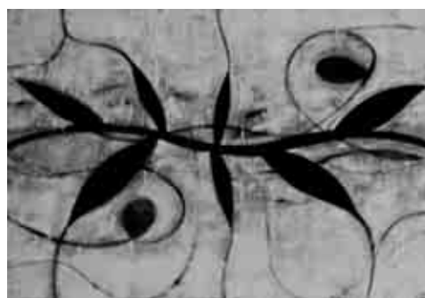
Genesis , 1996