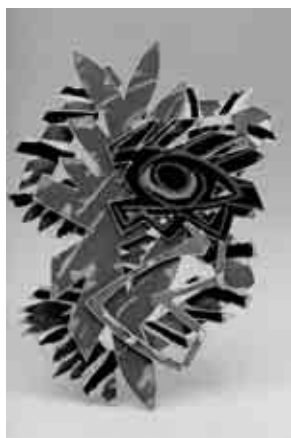
At The Snare III , 1984

Brooch – Silver, enamel, gold wires & silver foil, 9ct. pin, 7.5 cm x 5.5 cm. First exhibited: Victoria & Albert Museum, London, 1984.