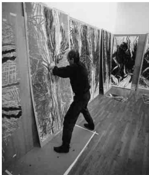
Melusine II , 1992