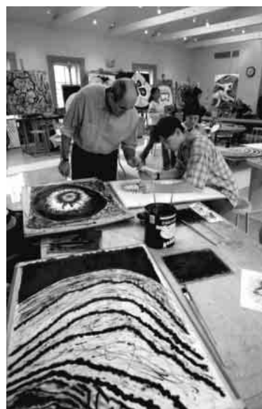
Growing Things™ Workshop 1999 Suffield Academy, Connecticut